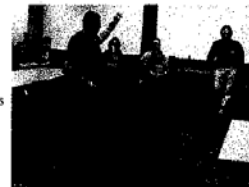
Cyrus visiting with the kids!