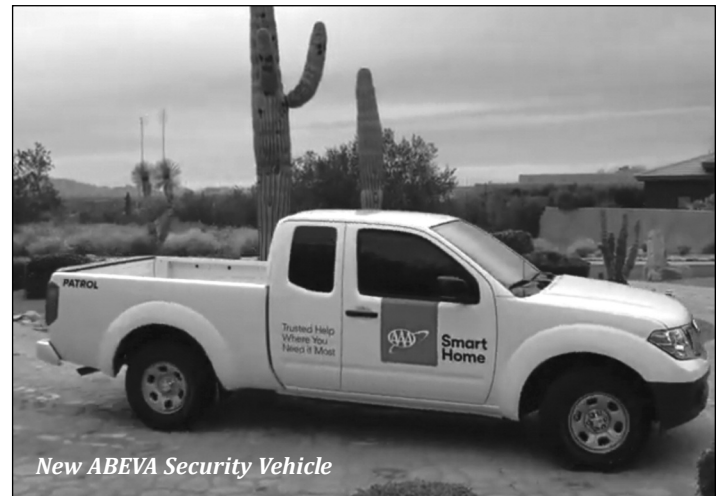
New ABEVA Security Vehicle