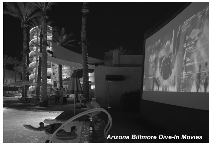
Arizona Biltmore Dive-In Movies

Finally, the Biltmore is celebrating Labor Day the weekend of August 31st with pool parties, dive-in movies and other activities to help you chill-out and stay cool. Stay up to date at ArizonaBiltmore.com/Summer to make reservations. ❖