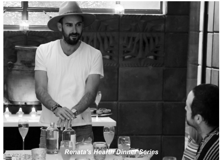
Renata's Hearth Dinner Series

As summer continues to simmer, the Arizona Biltmore has a wide range of unique offerings for our esteemed neighbors. Introducing Fuego y Pasi3n, a brand new dinner series at Renata's Hearth, a modern Latin restaurant. Join in at Renata's Hearth on August 20th or 27th to indulge in a refined evening of delectable bites, perfectly paired cocktails, and captivating conversations with the culinary artisans behind the scenes. Immerse yourself in this exceptional dining experience that promises to be an unforgettable culinary symphony. Secure your seat at the table today through RenatasHearth.com/summer-dinners/ and prepare to be enchanted by an extraordinary blend of flavors, expertise and camaraderie.