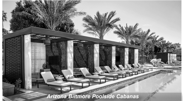
Arizona Biltmore Poolside Cabanas

Labor Day Weekend is a splash at the Arizona Biltmore! September 1st through the 3rd, book a cabana at the adults-only Saguaro Pool to enjoy DJ beats or a cabana at Paradise Pool to enjoy extended waterside hours and a dive-in feature of Field of Dreams . On Saturday, the Saguaro Pool will sparkle during the Biltmore Bubbles Champagne Party from 11:00 a.m. to 6:00 p.m., followed by the Glow Party from 7:00 p.m. to 10:00 p.m. Sunday brings DJs to both Paradise and Saguaro Pools, a cabana or day pass is your ticket to the holiday fun. More information and booking details can be found at ArizonaBiltmore.com/summer .