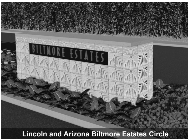
Lincoln and Arizona Biltmore Estates Circle

Wright wanted square blocks as opposed to McArthur's mathematically proportioned rectangle block that was used. The pre-cast blocks which McArthur used became known as the "Biltmore Blocks." The blocks had a diverse geometric design and were made on site from desert sand.